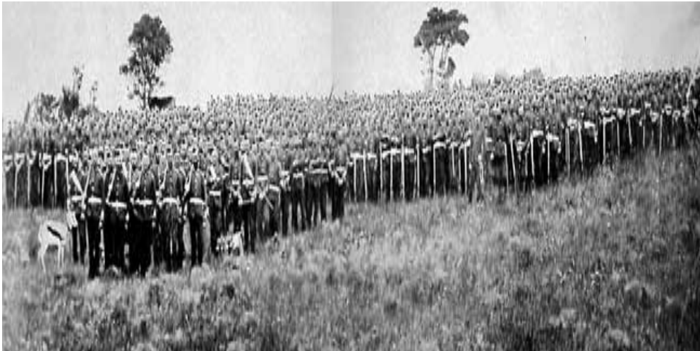
2 nd 24 th Warwickshire Regiment